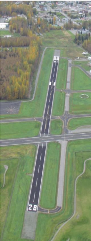
RW 28 & New Compass Calibration Pad