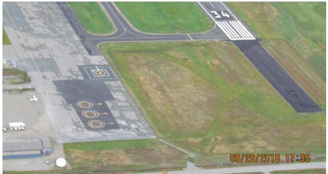
Photo: South Ramp Lighted Helipad, 3 Parking Spaces and Lease Lot area directly south

Begun in the summer of 2017, all of the elements of the Runway 16/34 Rehabilitation and Related Improvements Project have now been completed. The last element of the project saw the final touches applied to the new helipad area on the airport’s south ramp this fall. The new lighted helipad, helicopter parking spaces and lease lots are now open and available for use. If you are interested in renting space on the new Helipad Apron or Large Aircraft Apron, please contact Frank Kelly, Airport Superintendent.