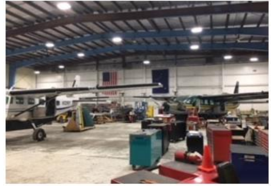
Photos: Ravn Connect 135 Maintenance Facility at Palmer Municipal Airport (Photo courtesy of Mark Swearingin, SVP-Tech Ops, RAVN Alaska)