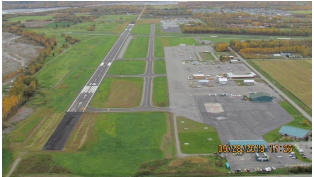
Photo: Approach to RW 16 with RSA brought up to current FAA standards, OFA area cleared. TW A and Interlinks after Pavement Maintenance Project