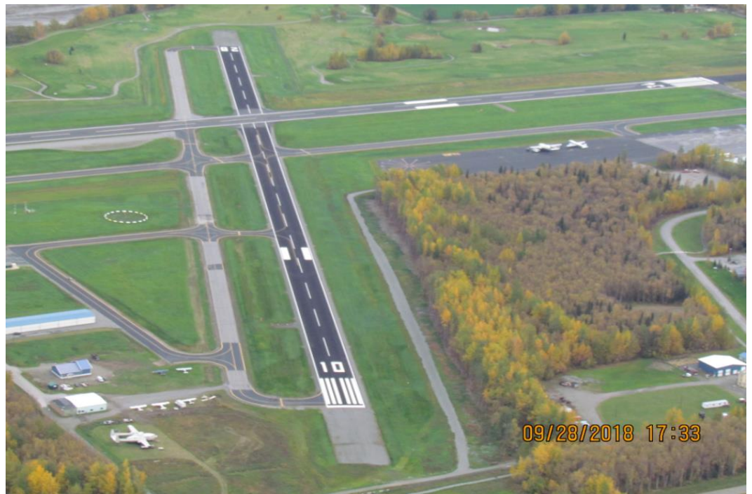
Photo: RW 10/28 with fresh asphalt surface treatment (AST) and markings, additional taxiway maintenance completed from the 2018 Taxiway Maintenance Project

The 2018 Taxiway Pavement Maintenance Project begun this summer is also now 100% complete. Except for certain sections of Taxiway B, all other Taxiways received crack repairs, crack sealing, new asphalt surface treatment and fresh taxiway markings.