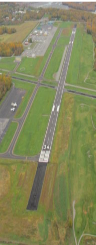
RW 34 & RSA Area, Large Aircraft Apron Expansion