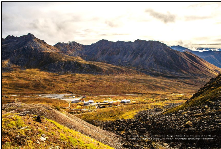
The photo was taken from the town of the upper Independence Mine (part of the 200-foot level) looking down at Gold's Gulch. The lower Independence mine is visible in center frame.

Reflections in Carbide – We have a new exhibit up at the Palmer Museum! Local photojournalist Adam Christiansen spent part of last summer documenting drawings and notations