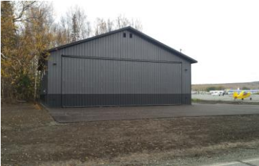
(Photo: New private hangar located at 805 E. Yukon Street is ready for aircraft and pilots to enjoy)