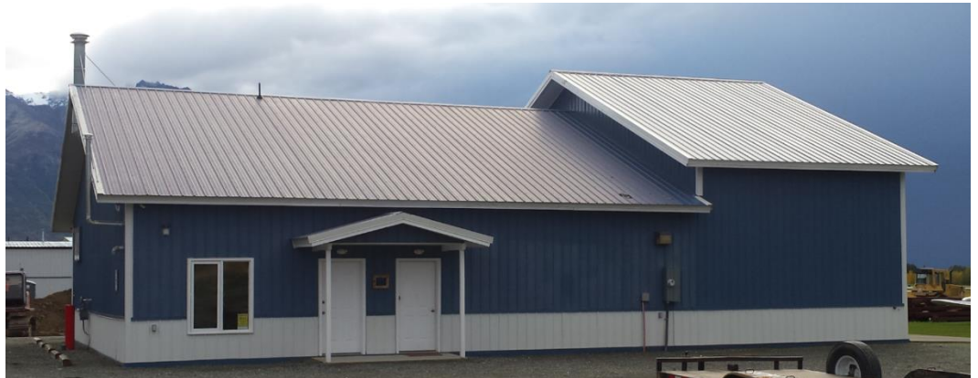
(Photo: The newly completed Kingdom Air Corp’s facility at the Palmer Municipal Airport)