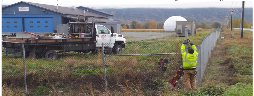
(Photo: AAA Fence Company performing some fence line and gate repairs on the south ramp area)