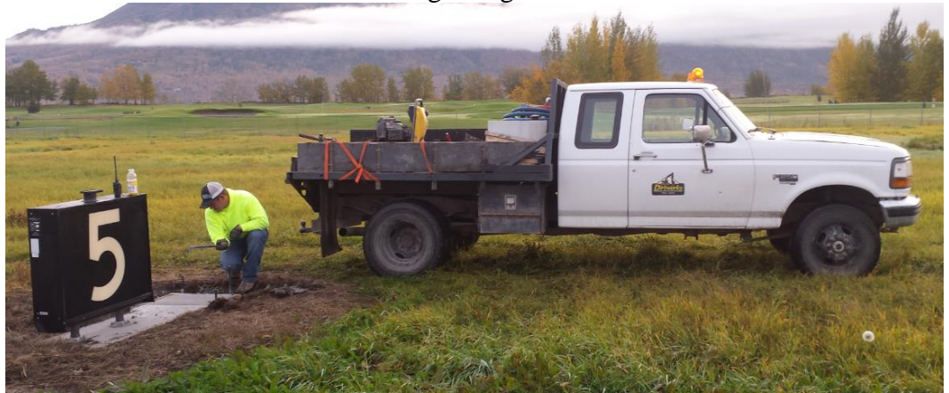
(Photo: Dirtworks Inc. completes foundation extensions for new airfield directional signs that are on the way)

Dirtworks, Inc. has been awarded the construction contract and activities have begun on the 2019 “Airfield Safety Improvements” Project. The seasonal related items have been started before winter sets in so that progress can continue on the Apron lighting, directional airfield signage and vehicle signage, weather and material delivery dependent. Fence line and gate repairs are slated to be completed by the end of the month with the tree clearing of the transitional surface off the south of RW 10/28 beginning soon as well.