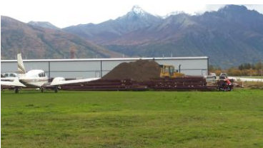
(Photos: A beautiful backdrop frames the new Aurora Sky Hangar project as the red iron awaits the foundation on the way)