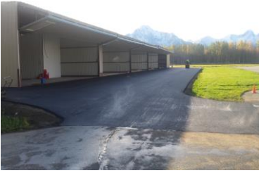
(Photos: The Asphalt crew with Pioneer Peak Paving apply the finishing touches on PAAQ Hangar Association Apron)