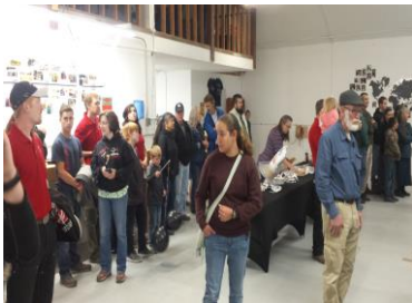
(Photo: KAC volunteers, donors and friends celebrate the hangar dedication)