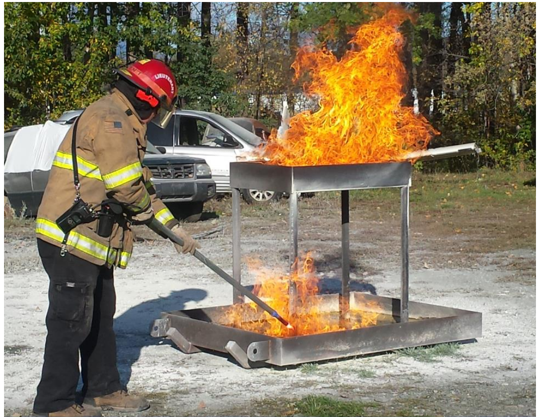
(Photo: Lt. Jeff Vincent, course instructor for Fueling Safety Training with Palmer Fire and Rescue, prepares the specialty constructed fire extinguisher training platform for course participants)

If your organization or you are a small aircraft pilot and have interest in attending future aircraft fueling safety training events, please feel free to contact the Airport Superintendent at (907) 761-1334.