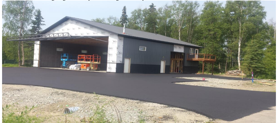
(Photo: Fresh apron paving is completed on a private hangar development for Lease Lot 19 on July 1 st )