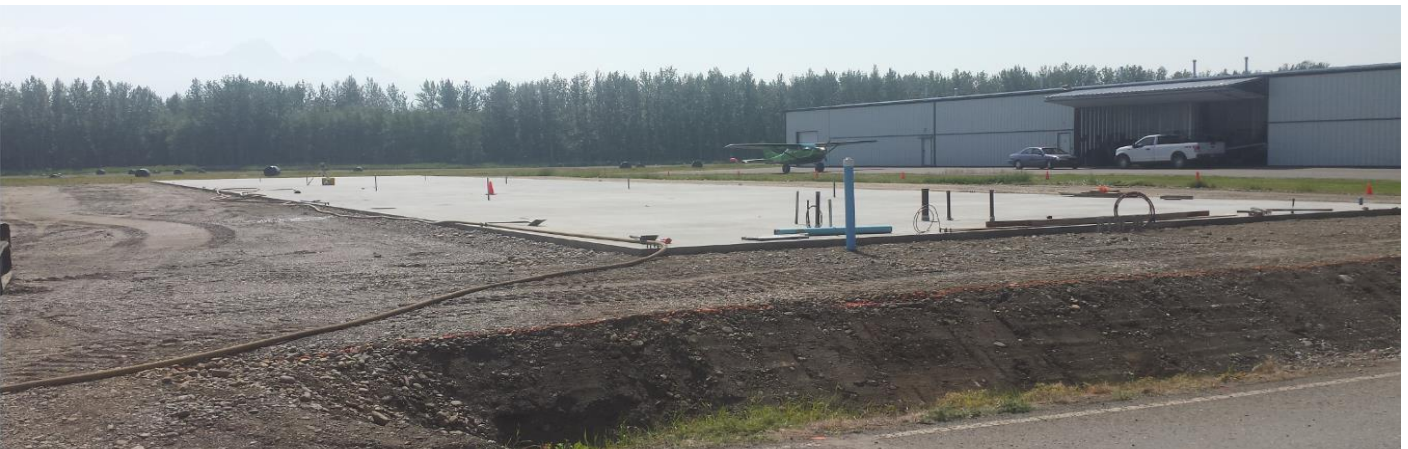
(Photos: The New PAAQ Hangar Association building located at 780 East Yukon Street under construction, foundation complete June 28 th )