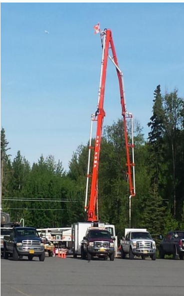
(Foundation work is completed May30th)

Many new projects have begun to take shape at the airport with several more slated to start this summer and fall. Some of last’s year’s projects are getting the final touches as well.