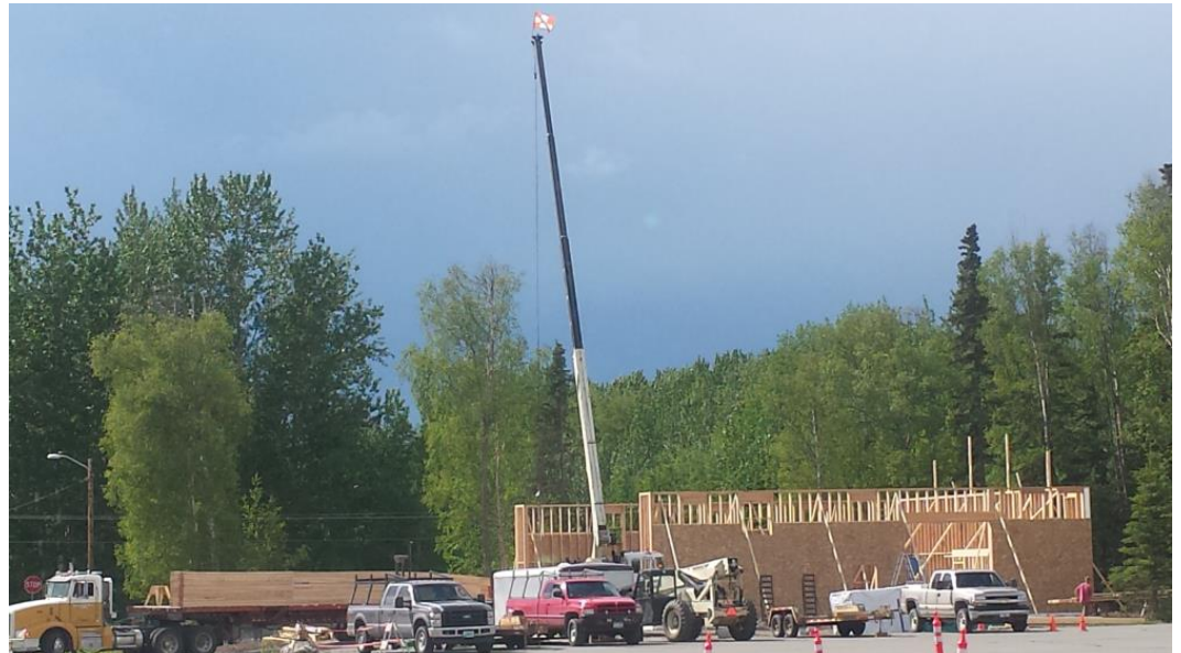
(Photo: Trusses are going on for a private hangar development for Lease Lot 19 on June 6 th )