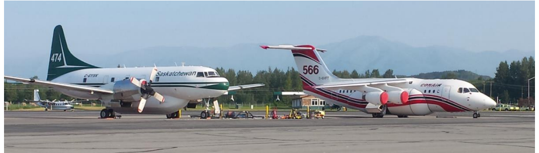
(Photo: A new line up of firefighting aircraft appeared on the North Ramp in June)

The State of Alaska, Division of Forestry operations are now in high gear at PAQ! Numerous new wildland firefighting aircraft have arrived on scene to help combat this year’s crop of wildland fires in South Central Alaska. Please be sure to allow these aircraft priority status on the airfield and in the skies above so that they can effectively and efficiently do their work.