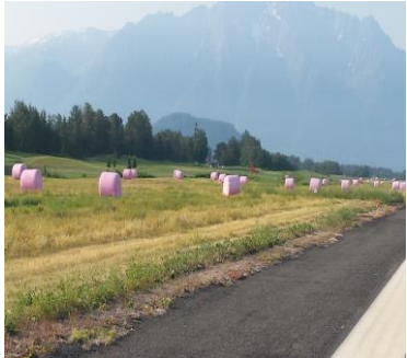
(Pink and green add color to a smoky skyline at PAQ)