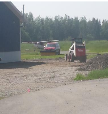
(Kingdom Air Corps recnetly completed hangar is getting the final site work around it’s new Hangar)