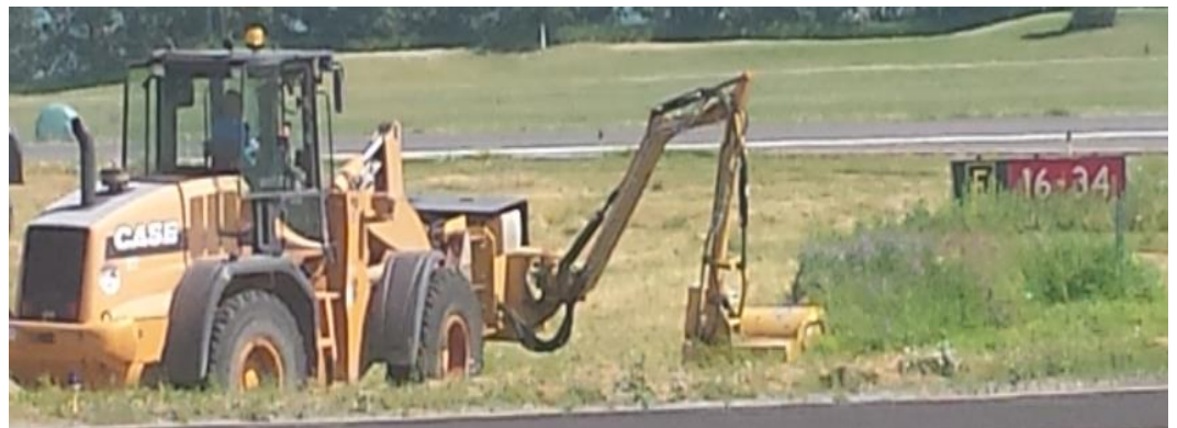
(Photo: A Public Works Equipment Operator works to clear vegetation around directional airfield signs)