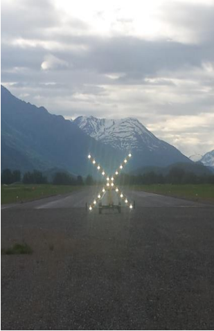
RW 10/28 Closure