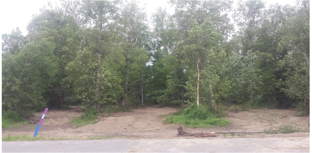
Photo: Aeronautical Campground area cleared and top soil being placed prior to path development and seeding.

Work continues to progress on the new Palmer Municipal Airport Aeronautical Campground. Half a dozen tent campsites have been cleared with room for picnic tables and several small fire rings. Located behind Apron A and adjacent to the Flight Service Station and aircraft transient parking area, it will give "Fly-In" tent campers easy access to their parked aircraft, water and a porta potty.