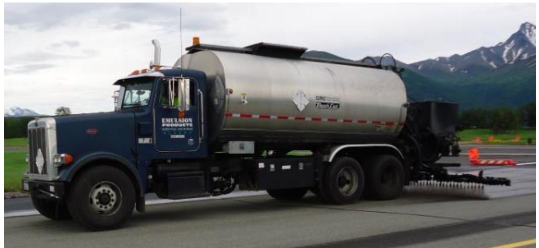
Photo: Fresh Asphalt Surface Treatment being applied to runway 10/28