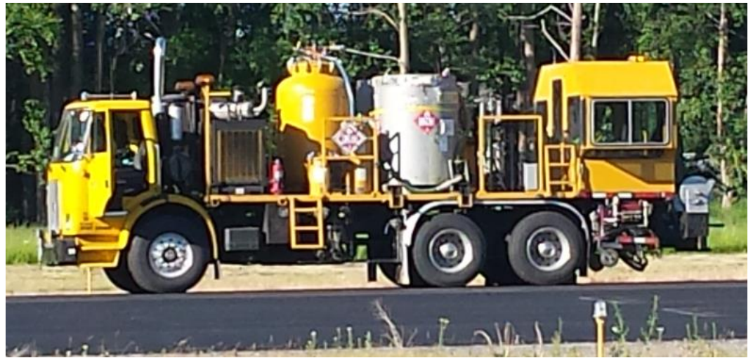
Photo: New markings being applied to runway 10/28