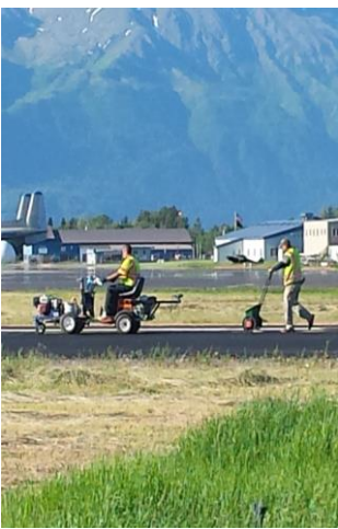
New Pavement Markings being applied