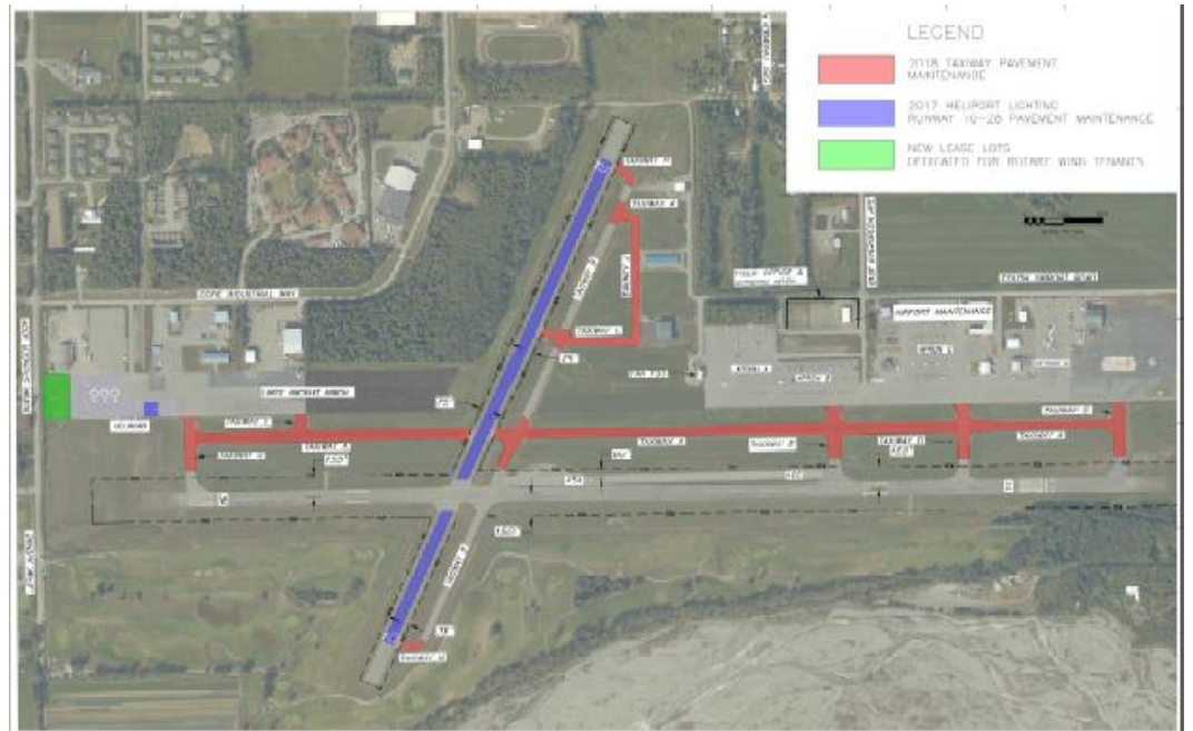
Diagram: Red areas indicate 2018 Taxiway Maintenance Project, Blue area Runway 10/28 project

The 2018 Taxiway Pavement Maintenance Project will begin soon. Pruhs Construction Company has again been awarded the construction contract for this project and HDL Engineering Consultants will continue to perform the construction administration services. The areas outlined in red will receive crack repairs, crack sealing, new asphalt surface treatment and fresh taxiway markings.