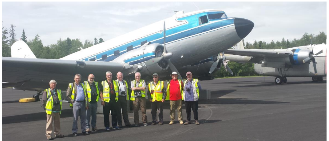
Photo: Members of Air-Britain in front of Kingdom Air Corps 1944 DC 3

On June 29 th , the Palmer Municipal Airport was visited by aviation enthusiasts who are members of Air-Britain, an international association of over 4,000 members dedicated to the recording and preservation of aviation history throughout the world. Air-Britain has been in existence for over 70 years covering all aspects of aircraft history and publishing monthly and quarterly magazines, as well as 15 to 20 books per year.