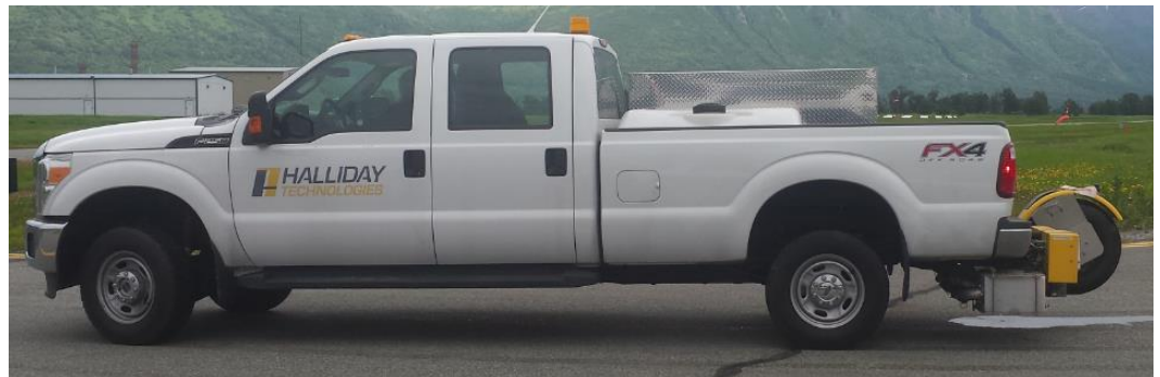
Photo: Friction test truck completes a test prior to the Asphalt Surface Treatment being applied to runway 10/28

After extensive friction testing, before, during and after, the final Asphalt Surface Treatment has been applied to runway 10/28. The new markings were completed on July 3 rd with the runway reopening that evening. Thank you for your continued patience during this process.