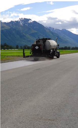
Fresh AST Application