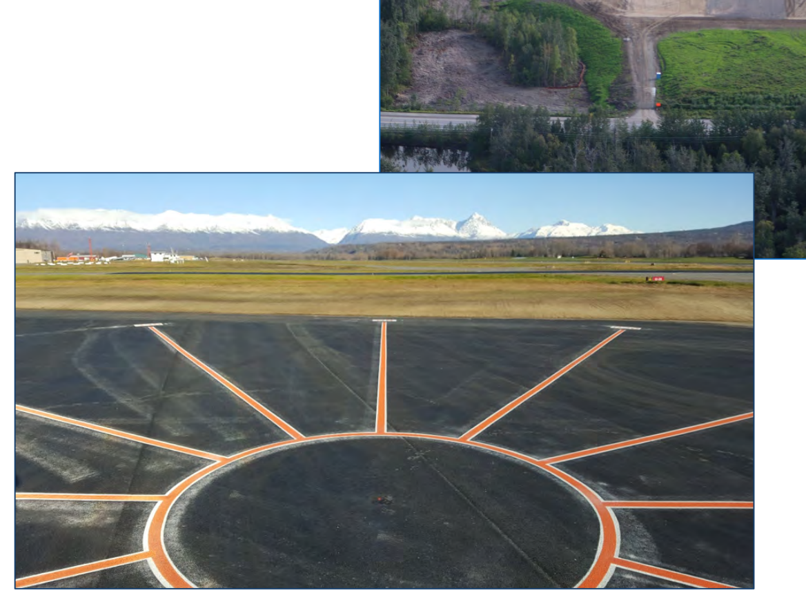
The new FAA-standard compass calibration pad on the expanded large-aircraft apron.

Trees were removed east of the runway 16 approach to increase the runway safety area.