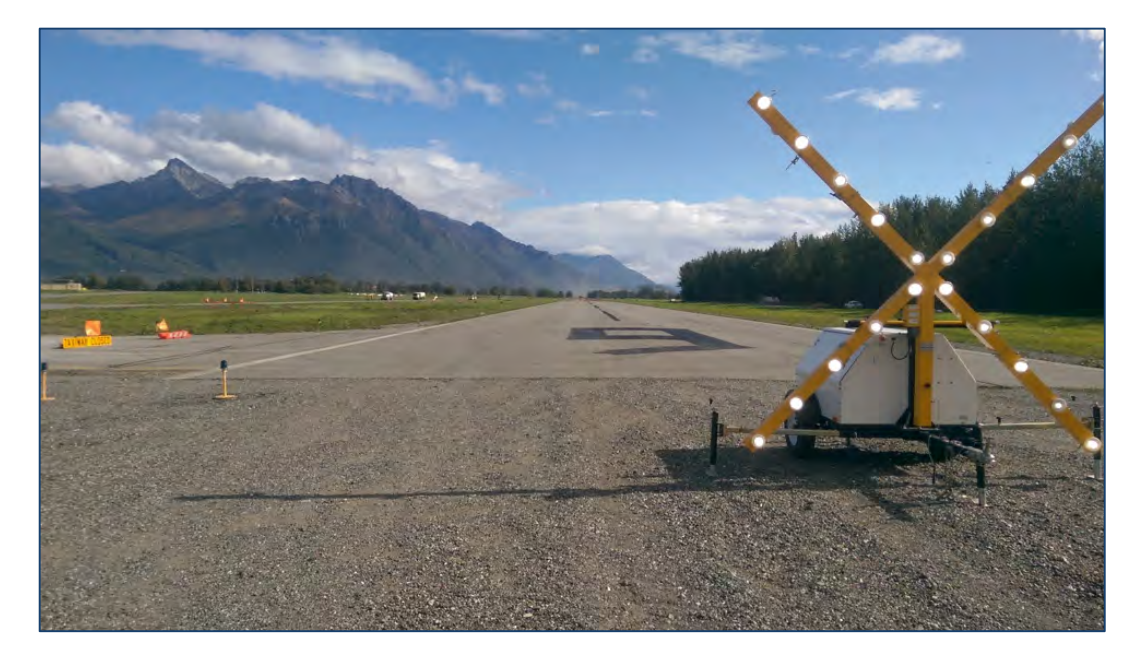
Runway 9/27 markings were removed (top photo) and remarked as runway 10/28 (bottom photo) to match the current magnetic declination.