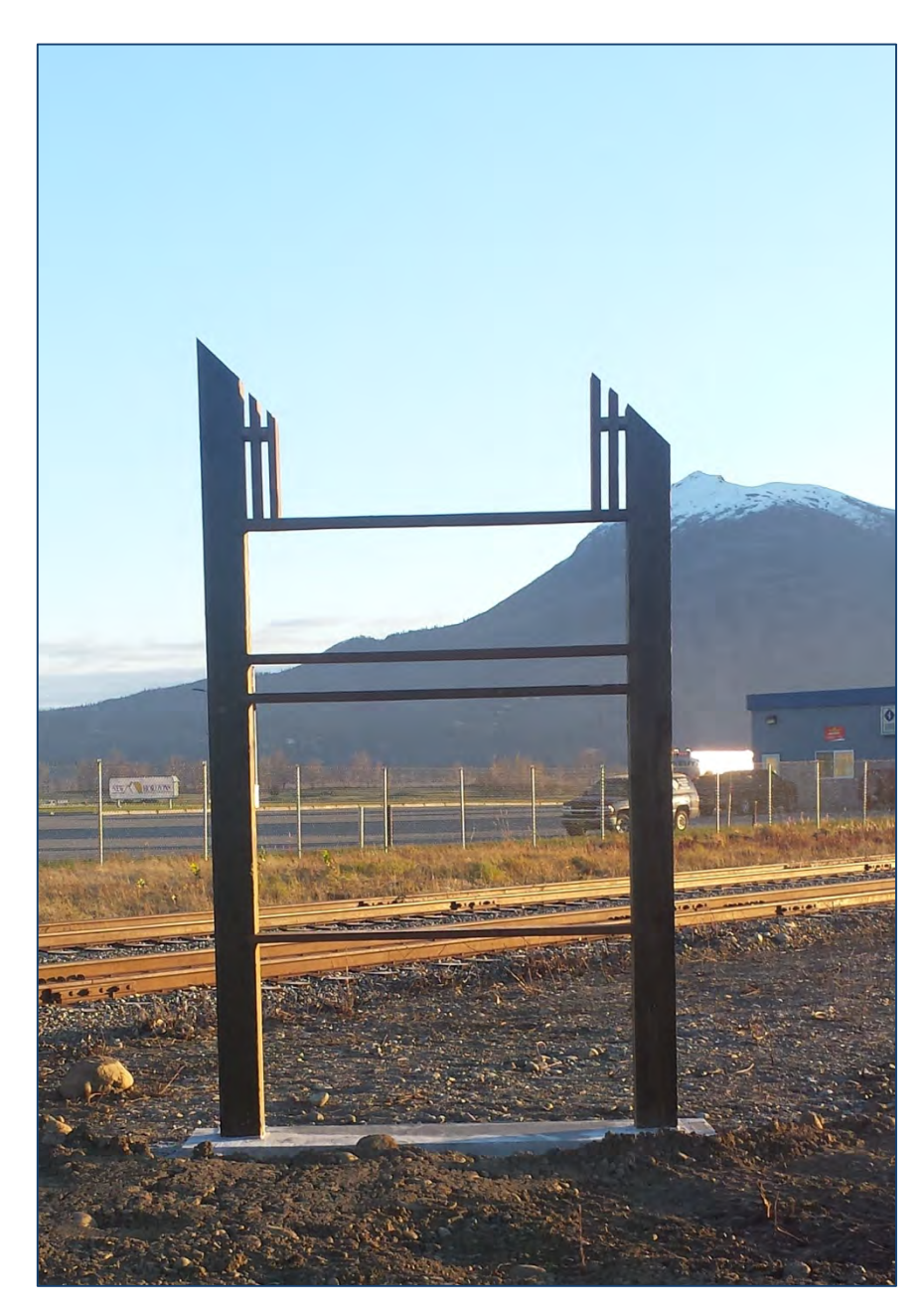
Framework for the new signs

City of Palmer Public Works website: <u>https://goo.gl/rJvDPV</u>