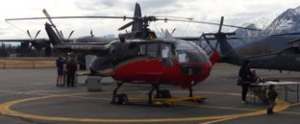
Aurora Sky MBB 105C