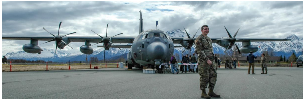
Photo: Air National Guard C-130 with Airman