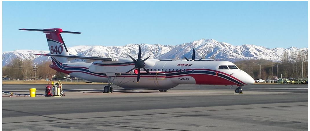
Photo: CONAIR Q400-AT on Forestry Ramp Summer 2021

The new specially outfitted Q400-AT arrived at Forestry for testing in Alaska. The new Q400-AT will be taking the place of the signature Convaire CV580 that has come to Palmer for years. This new aircraft is touted to be at least 25% more efficient and faster than the CV 580.