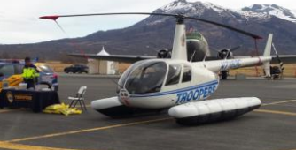
AK State Troopers R 44