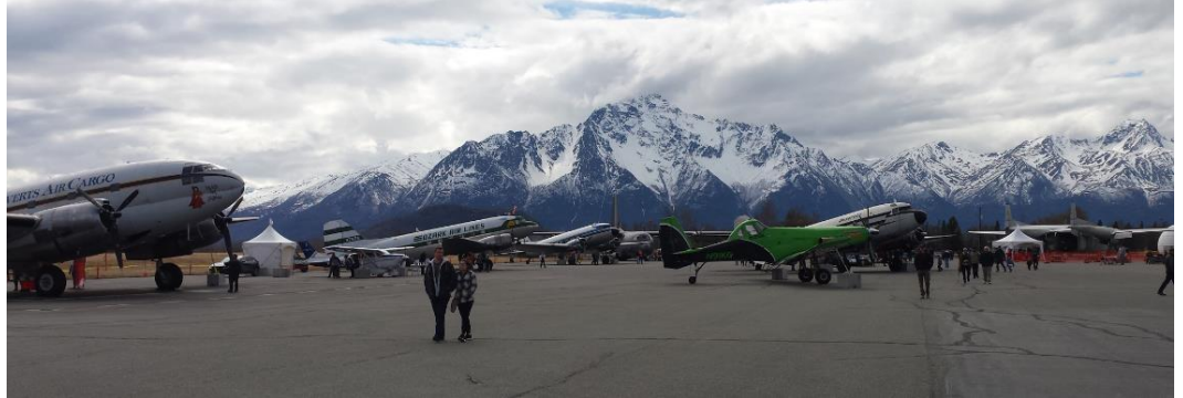
Photo: Static Aircraft Displays abound under the backdrop of Pioneer Peak