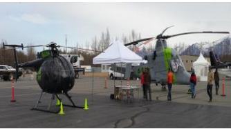
Rotak's KA 1200 & MD 500