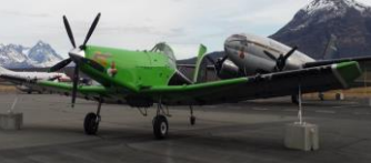
Glenn Air Inc M18