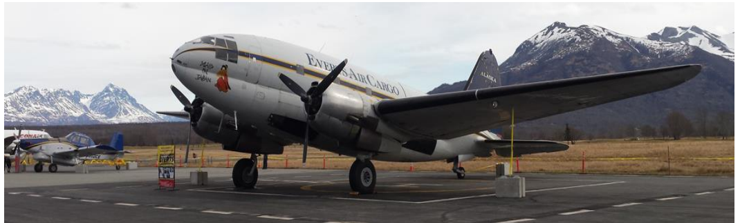
Photo: Everts Air Cargo C-46D Commander and AT-802