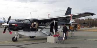
Daher Kodiak 100