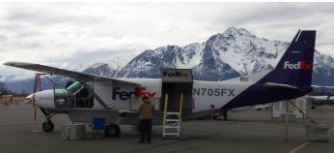
Fed Ex Express C208