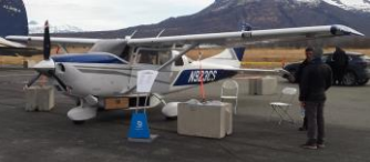
Northland Aviation C206