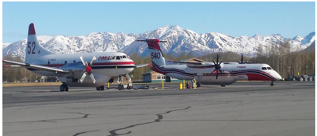
Photo: Convaire CV580 and the new Q400-AT side by side comparison