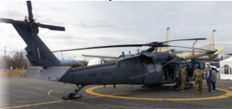
Air National Guard Pave Hawk