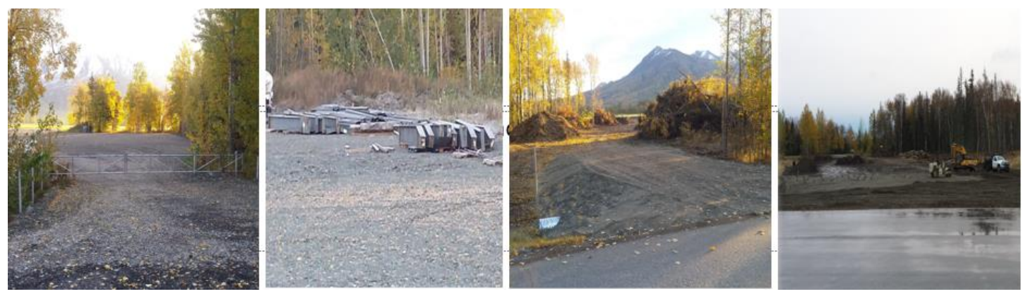
Photos: ADD Investments driveway, pad and red iron await a new slab. Skye Quest Aviation driveway and site preparation are nearing completion.

Both ADD Investments LLC and Skye Quest Aviation LLC are pushing hard to get concrete in before winter snow arrives. Lease space will be available once hangars are up and running. Please see the airports business and services directory for company contact information.