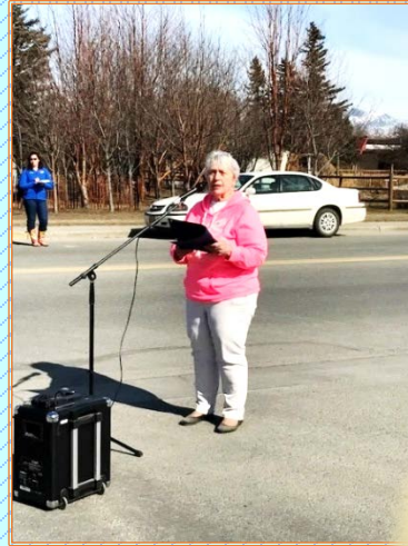
At Veterans and Senior Home in Palmer