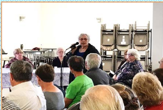
Mayor at Valley Interfaith Organization meeting