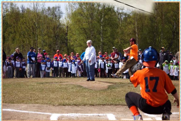
Opening Ceremony / Palmer Little League 2017