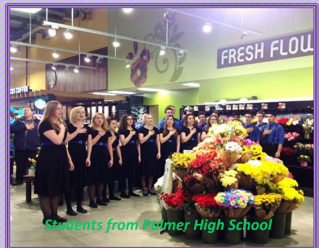
Students from Palmer High School

This newsletter is published monthly by the City of Palmer. For subscription, please contact jmazurkiewicz@palmerak.org or (907) 761-1317. Submission deadlines is on 15 th of each month.