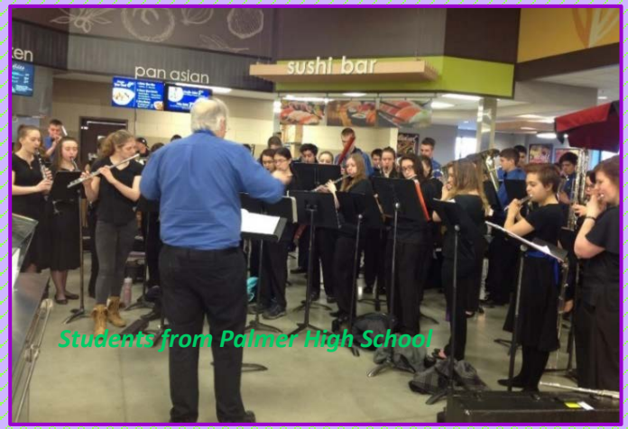
Students from Palmer High School

This newsletter is published monthly by the City of Palmer. For subscription, please contact jmazurkiewicz@palmerak.org or (907) 761-1317. Submission deadlines is on 15 th of each month.