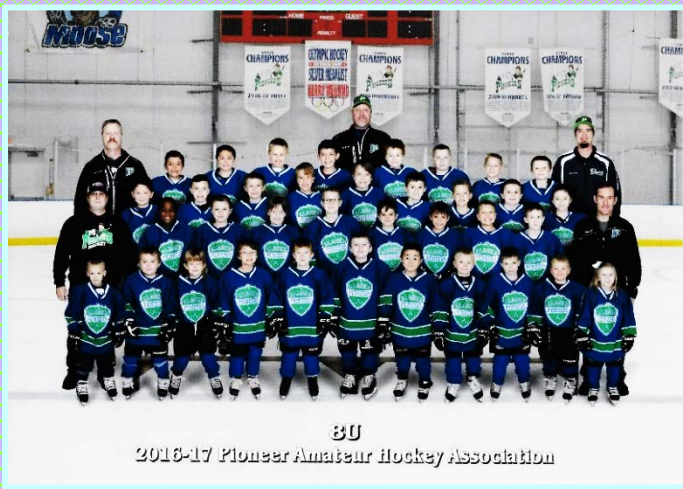
BU 2016-17 Pioneer Amateur Hockey Association

The Learn to Skate Program has been very successful in providing the beginning foundation for kids to either join the Palmer Hockey Association (PAHA) or taking up figure skating. "I have witnessed kids from the Learn to Skate Program (LTS) doing things never seen before here. Last night I watched a young skater stick a double Axel jump that would have made any Olympic figure skater smile. I had remembered seeing this young skater from our Learn to Skate program years ago as a beginner and to see the progress and the love of skating as she landed her Axel only made me smile with happiness. It has been a treat to watch those young skitters. Keep up the great work all of you! Spread the word good